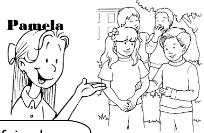
talk to friends